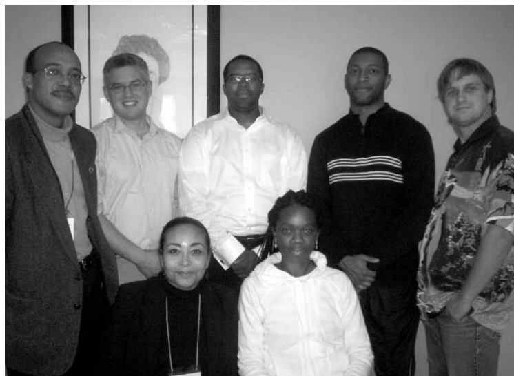
At a recent meeting with some of the founding members of NCRC:

We will build a coalition that allows us to build collective power, respect the integrity of our communities, cultures and faiths, and strengthen our own organizations.